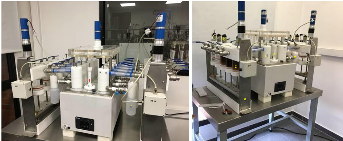
Figure 3. Prototype Anaero Technology MEDUSA automatic feeding system for BMP in operation in Cali, Colombia since November 2016.

Figure 3 illustrates a working prototype of automatic feeding for Anaero Technology BMP systems in operation since November 2016. Each side of 5 reactors is fitted with a feeder module (a) that has 5 individual feeder syringes (b) with their own agitators (c) to homogenise feed as it is dispensed to the reactors (d). To enable better flow of feed into the reactors and reduce potential short-circuiting of feed, modified reactor heads are fitted, which also enable digester level control and digestate collection vessel (e). Due to the smaller diameter of pipework fibrous material is less suited for these reactors, although continuous research on food waste may still be possible filtering out fibre. The 5 central reactors (f) can continue to be used for batch tests. The original water bath, gas flow meter, and mixer module remain. A new electronic control system is included to program the operation of the feeder modules, agitator and mixer motors.